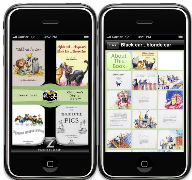
Figure 1. Today's ICDL for iPhone application displays children's books that can be read on an Apple iPhone. (a) Four books to choose from. (b) An overview of the Arabic/English book, Black Ear... Blonde Ear .

It has been found in many struggling economies that access to educational services and materials has actually declined in recent years [1, 8]. This coupled with the lack of success for many children in traditional school settings, seems to suggest that a different approach to education is needed. Studies have shown that interactions between older and younger people, can improve children's motivation for learning, and increase their awareness of personal and community culture [8, 13]. Yet, little discussion in the research literature on mobile computing focuses on