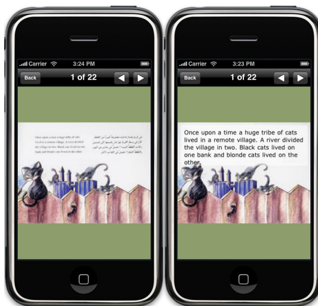
Figure 2. Reading a book in the ICDL for iPhone application. (a) An example of one page of the book. and (b) The same page with the English text magnified.

Seventy-three-year-old Myles and nine-year-old Dana are sitting on our couch reading the Arabic/English book, Black Ear... Blond Ear , by Khaled Jumm'a. It is a book about two groups of cats, the light-colored cats and the black cats,